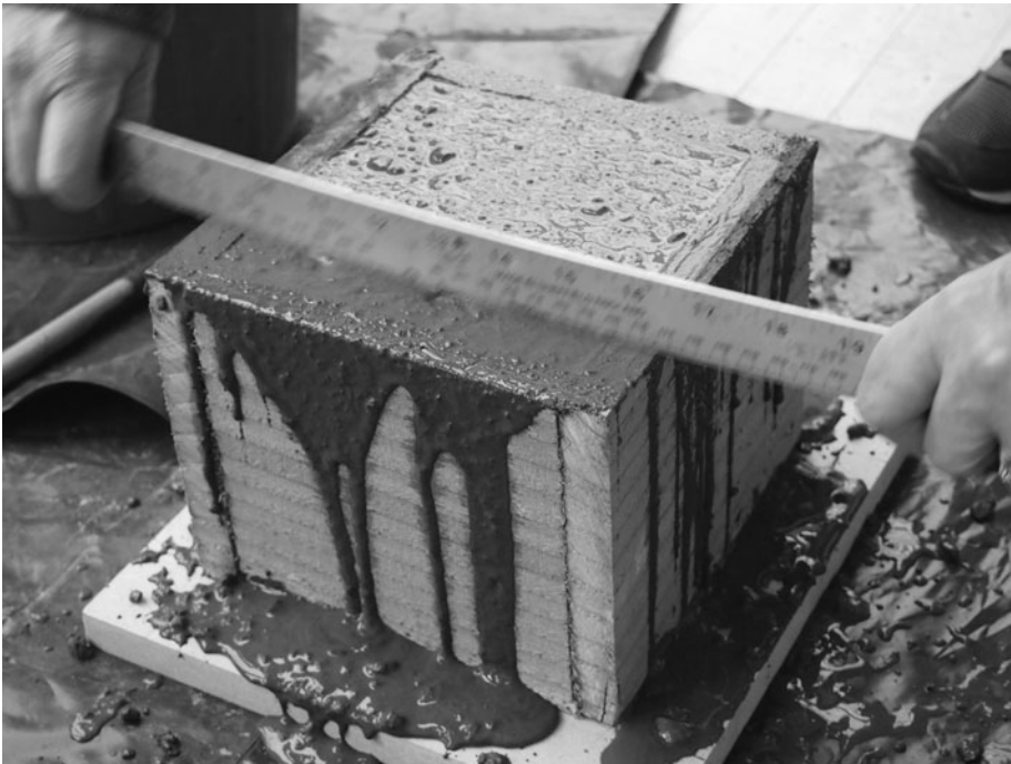
Figure 2. Flattening (Concrete Experiments) , 2015.

Characteristic of our experiments with concrete has been the impulse to carefully fashion and smooth its surfaces; an impulse which emerged almost as soon as we poured the molten material into its form. As we noted in the first gesture, concrete’s production process and its ultimate use depends as much on the construction and