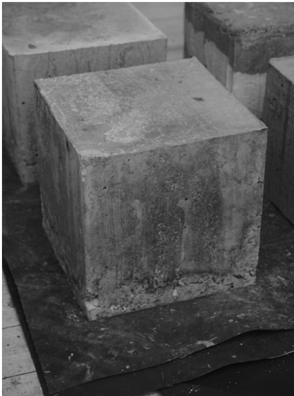
Figure 3. Curing (Concrete Experiments) , 2015.

mix can become overheated. Concrete that has reacted too quickly does not allow time for the crystals to grow and results in a structure that is weak, dusty, pitted and cracking.